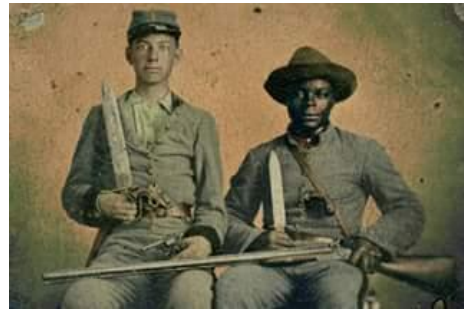
Two Mississippi soldiers, one of whom happened to be among a class of combatants we're constantly being told by self-righteous "academics" didn't exist.