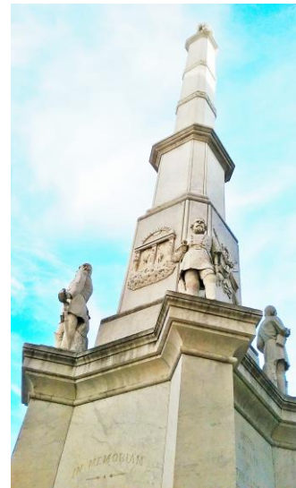
Our monument, photographed on Lee's Birthday.