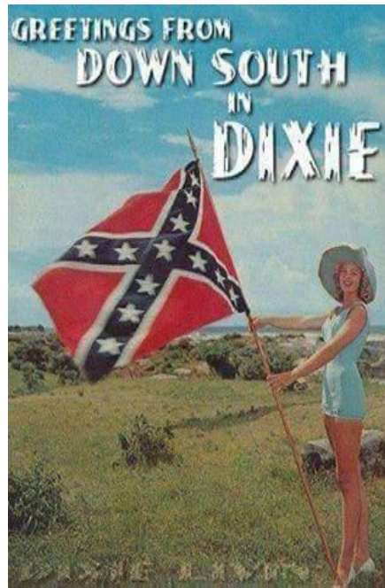
A vintage magazine advertisement.

Second, I intend to visit a number of historic sites in Virginia this coming weekend, and will report back on the condition they are in.