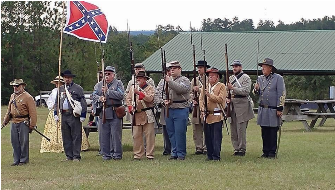
The Honor Guard at the dedication of the new monument in Aiken County.