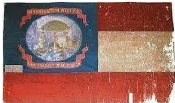
The company flag of the Washington Rifles.