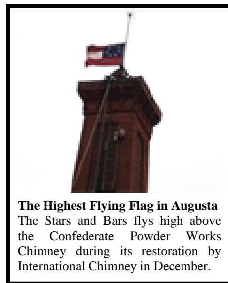
The Highest Flying Flag in Augusta The Stars and Bars flies high above the Confederate Powder Works Chimney during its restoration by International Chimney in December.