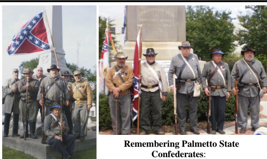
Remembering Palmetto State Confederates:

The annual Sons of Confederate Veterans International Reunion will be held in Murfreesboro, Tennessee on July 11-14th this year. I'm not sure if any Alexander Camp compatriots plan to go, (Continued on page 3)