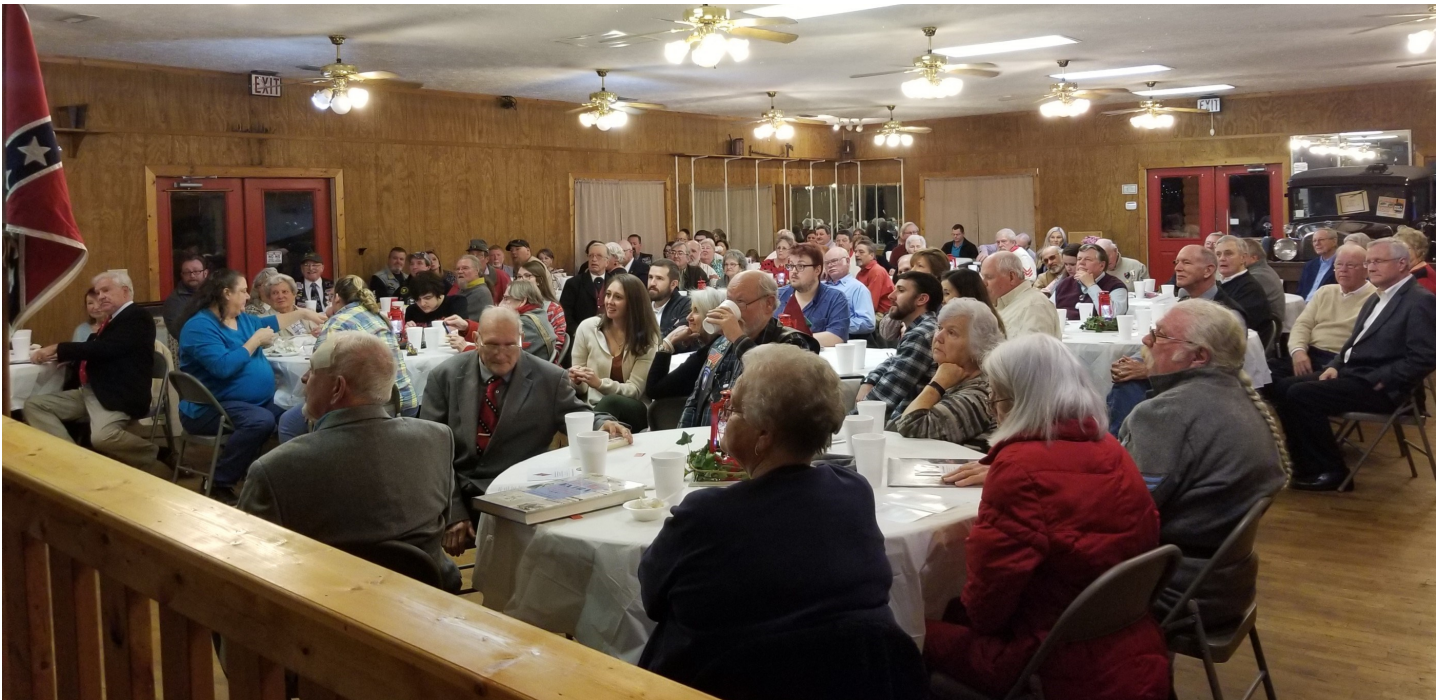
A view of the record crowd at the Lee-Jackson dinner attendees at Bobby’s BBQ in Graniteville on January 25th.