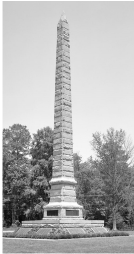
Point Lookout Confederate Cemetery Monument

Pt Lookout was one of the largest Union prison camps that housed Confederate military and pro-Southern civilians. The prisoners were of several races and ages—ranging from newborn to adulthood. Of the more than 52,000 imprisoned there, more than 14,000 perished on that barren strip of land that is surrounded by water on three sides.