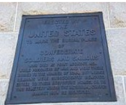
Federal Confederate Cemetery Memorial plaque, over the site of a mass grave of 3,384 Confederate soldiers

Indentations of the original main avenue that ran through the camp can still be seen near the constructed partial parapet wall. The prisoners cemetery is located before the park entrance. An 85 foot monument erected by the US Government (the first monument dedicated to Confederate soldiers) towers over the graves of 3,384 of those who died at Point Lookout.