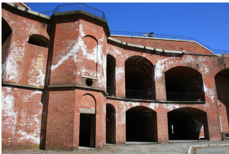
Circular stairway near northeast bastion