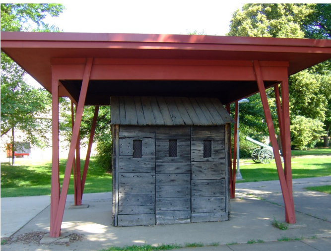
Preserved Stockade section at Camp Randall