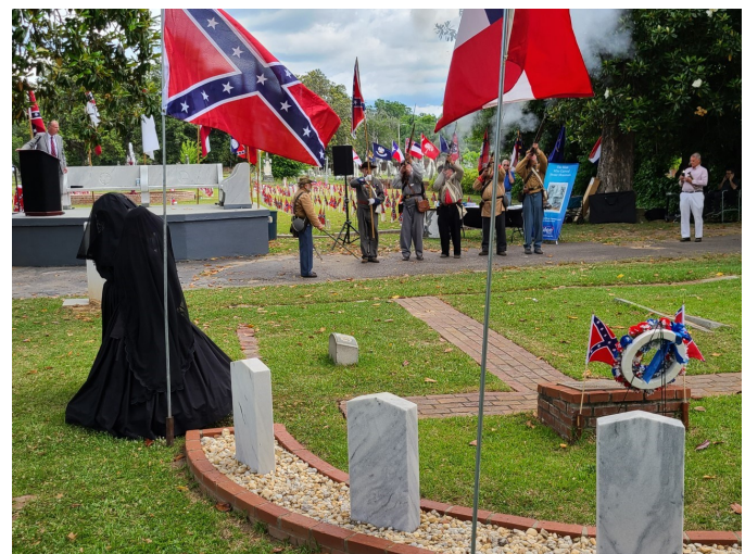
Honor Guard at Confederate Memorial Day

You do not have to be a member of the SCV to obtain this specialty tag. The plates are available thru the DMV, either in person, or thru http://www.gascv.org