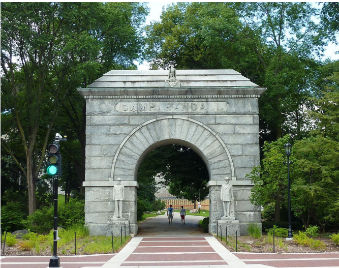
Memorial Arch at Camp Randall, WI

Camp Randall Park is also the location of Camp Randall Stadium, opened in 1917 as the outdoor football stadium of the University of Wisconsin.