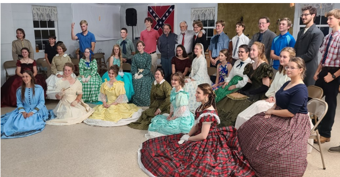
Campers in period costumes for the Closing Banquet and dance.

Campers from other States are welcome and campers parents don't have to be SCV members